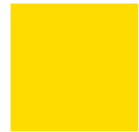
Goldenrod HEX FFDC00

Fonts Pick no more than 2, use bold and italics to add more interest and differentiate sections